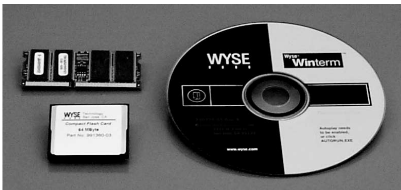
Figure 1-1 Upgrade Kit Contents