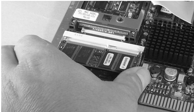
Figure 2-4 DIMM Insertion

Check carefully to ensure the DIMM is aligned properly and completely seated in the socket. The metal tabs should fit securely in the slots on the side of the DIMM.