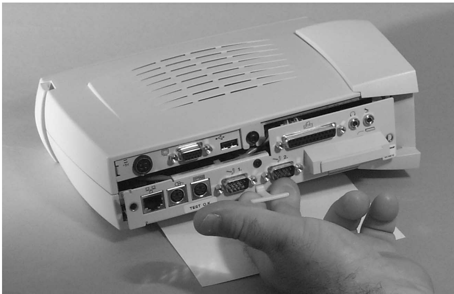
Figure 2-3 Extracting The Logic Card