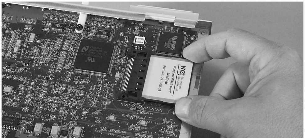
Figure 2-5 Compact Flash Insertion